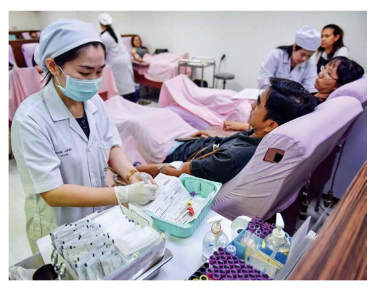
Bangkok, Thailand. A nurse keeps records of a blood donor at the Thai National Blood Centre on 14 June 2017.

tions presumably reflect differentials in income inequality, commitment to public health infrastructure, and the quality and reach of human resources for health. The WHO and World Bank also offer multiple measures of health spending–related financial hardship in assessing UHC, which do not increase monotonically with increasing income, health spending per capita, or coverage of health services. Rather, catastrophic health expenditures